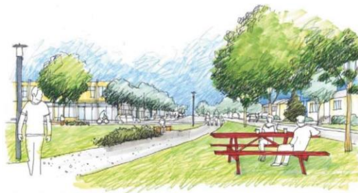
East Entrance - View west from Terrace Road gateway

We want to help build a better , sustainable street that is connected to our neighborhoods and used by our communities. We seek a place vibrant with commerce and social interaction, one that has the density to match. We're also collaborating on housing options and Social innovation ventures that will enhance urban wellness for all.